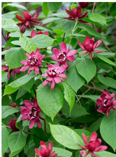
Common Name: Sweetshrub Scientific Name: Calycanthus floridus 'Aphrodite'

Sweetshrub is a deciduous shrub growing 4 - 6' tall by 4 - 6' wide. An old-school versatile plant well known for its use as potpourri due to its fragrant leaves and flowers. Flowering begins in May reblooming continually into September with its plentiful burgundy blooms. It is a dense, upright, multi-stemmed shrub. Large green leaves turn an attractive shade of yellow in the Fall. It grows in full sun to part shade, tolerates deer, and prefers a well-drained soil but is tolerant of most soil conditions. The blooms are fragrant and are said to have a scent compared to apples. A plant best utilized in woodland gardens but also makes for a great deciduous hedge.