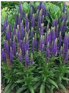
Common Name: Spiked Speedwell Scientific Name: Veronica spicata 'Royal Candles'

A low growing perennial, Spiked Speedwell reaches 15 - 18" in height and 15 - 18" in width. A full sun lover flowering through the summer season from June through August. The bright purplish-blue blooms are an attractor for butterflies and add great seasonal color to most gardens. It is a plant tolerant of drought conditions once establishes but prefers a moderately moist, well-drained soil. Utilize this plant for butterfly gardens, perennial borders, foundation plantings, and cutting gardens.