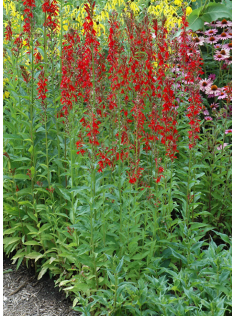
Common Name: Cardinal Flower Scientific Name: Lobelia cardinalis

A native perennial that lives up to its name, Cardinal Flower is best known for its scarlet red summer flowers. It is a plant best grown in full sun to part shade preferring a moist soil and tolerant of wet or briefly flooding soils. The abundant spikes of flowers emerge in July lasting into September and are a major attraction for Butterflies and Hummingbirds. Reaching a height of 2 - 4' upon flowering and a spread of 1 - 2' in width, this is a plant utilized in perennial borders, rain gardens, and naturalized areas.