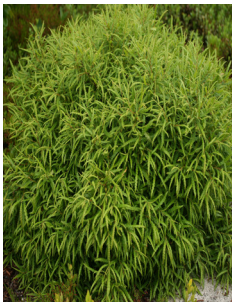
Common Name: Sweet-fern Scientific Name: Comptonia peregrina

A low-maintenance woodland shrub, Sweet-fern is best known for its glossy fern-like texture. A full sun to part shade shrub reaching 2 - 5' in height and 4 - 8' wide. It is a deciduous, upright, rounded shrub with lustrous dark green leaves. This native is versatile in that it can tolerate extreme conditions such as wet soils, drought, and wind. The fragrant leaves on this shrub deter deer from grazing on them. Due to its rhizomatous, spreading roots, Sweet-fern is best utilized in massing and mixed borders. It is a plant also used along roadsides and sheltered seashore areas as it has some salt-tolerance.